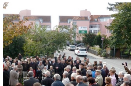
1. Int. Schweinfurth - Meeting